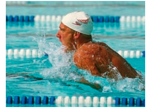
With HD Color technology

Along with 1200 x 600 dpi resolution, the HD Color printing technology of the C3600n Digital Color printer provides greater depth of detail and color, and a high gloss finish, even on ordinary office paper.