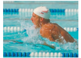
Without HD Color technology