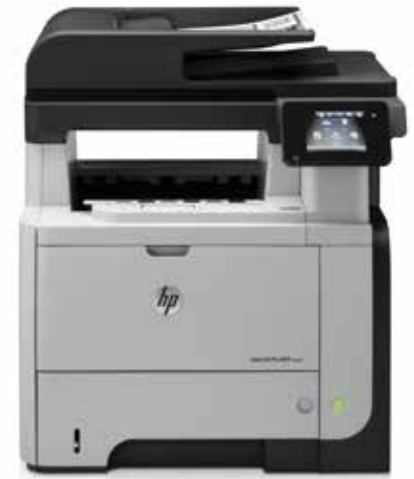
HP LaserJet Pro 500 MFP M521dn

Duty cycle (monthly): 12 Up to 75,000 pages