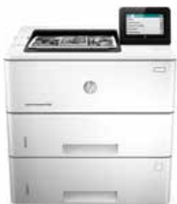
HP LaserJet Enterprise M506x