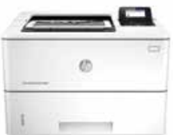
HP LaserJet Enterprise M506dn