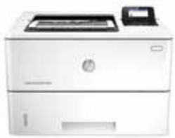
HP LaserJet Enterprise M506n

Finish key tasks faster with a printer that starts right away and helps conserve energy. 1 Multi-level device security helps protect from threats. 6 Original HP Toner cartridges with JetIntelligence and this printer produce more high-quality pages. 2