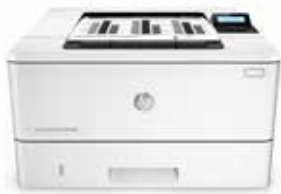
HP LaserJet Pro M402dn