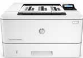
HP LaserJet Pro M402dw