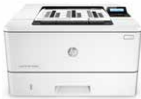
HP LaserJet Pro M402n

Printing performance and robust security built for how you work. This capable printer finishes jobs faster and delivers comprehensive security to guard against threats. 1 Original HP Toner cartridges with JetIntelligence give you more pages. 2