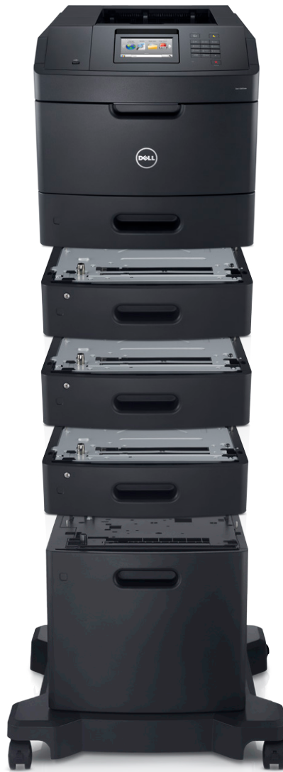
— 100-Sheet Multi-purpose Tray