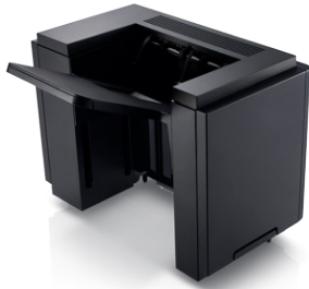
Optional 1,500-sheet output stacker Upgrade the output capacity to a maximum of 2,050 sheets by adding the 1500-sheet stacker.