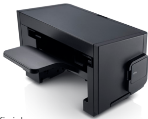
Stapler finisher Staples documents automatically, up to 50-sheets thick.