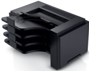
Optional 4-bin mailbox Automatically sort and stack print-outs into 4 slots.